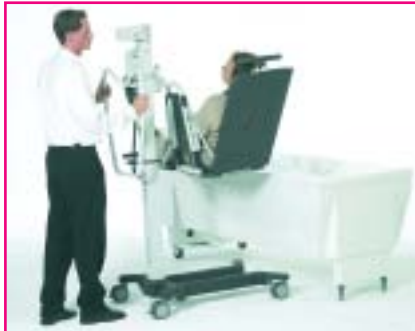
Simply move up to the bathtub,

Supplied with digital scales which can be integrated in the lift so that patient's weight can be measured and checked on the spot.