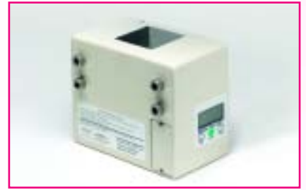
Integrated digital scales for the bath lift

MONA is a new bath lift from Horcher which offers optimum comfort thanks to the use of state-of-the-art Technology. With a soft, completely foam-covered lift bed it enables even patients who are sensitive to pressure and confined to bed to be moved and lifted by a carer. Getting from the bed to the bathtub is so much easier.