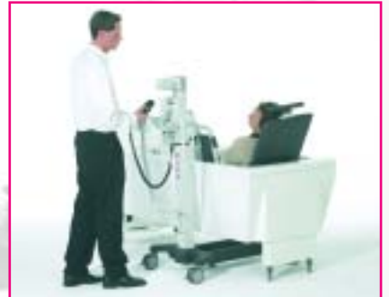
then bath and lift with ease.