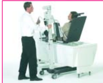
lower by means of remote control,